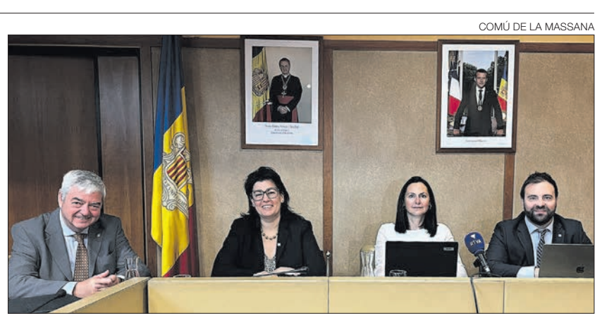
►► . Image of the ordinary session of the council of the municipality of la Massana.

Another of the points was the approval of the addendum to the collaboration agreement between the Government and the municipality for the construction of affordable housing in Ribasol. Specifically, it was approved that the payment be made