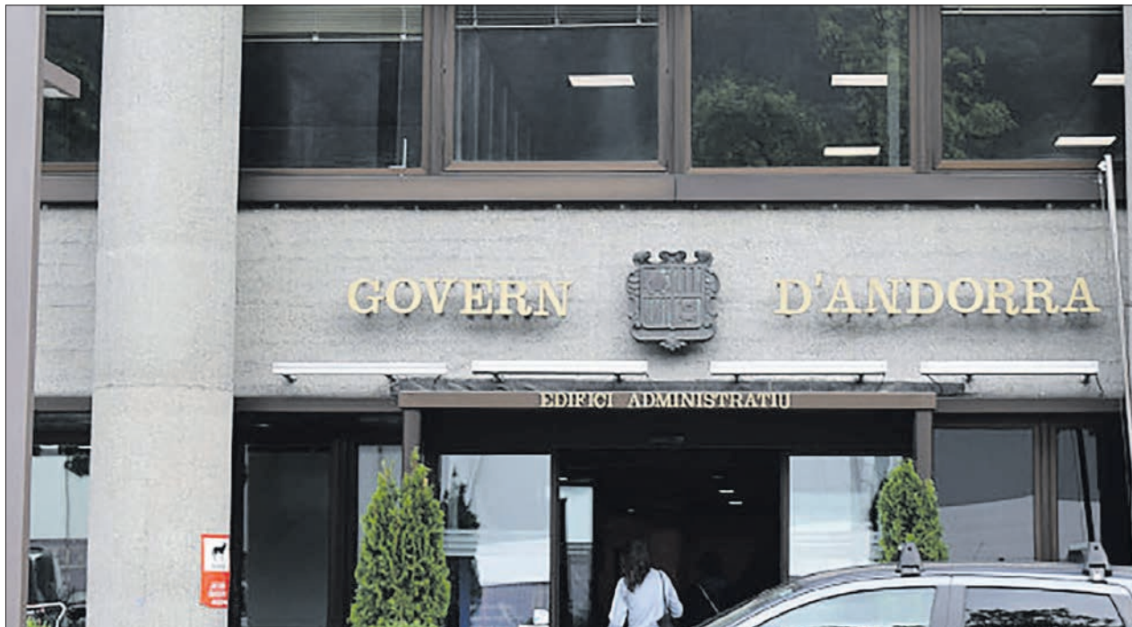
► Image of Government.

The evolution of GDP is marked by the dynamics of services, given that the sector has accounted for more than 80% of GDP in recent years. In the second quarter of 2023, the area of economic activity has experienced a growth of 2.1%. It should be noted that all sectors show positive values in the second quarter of the year. The constructi-