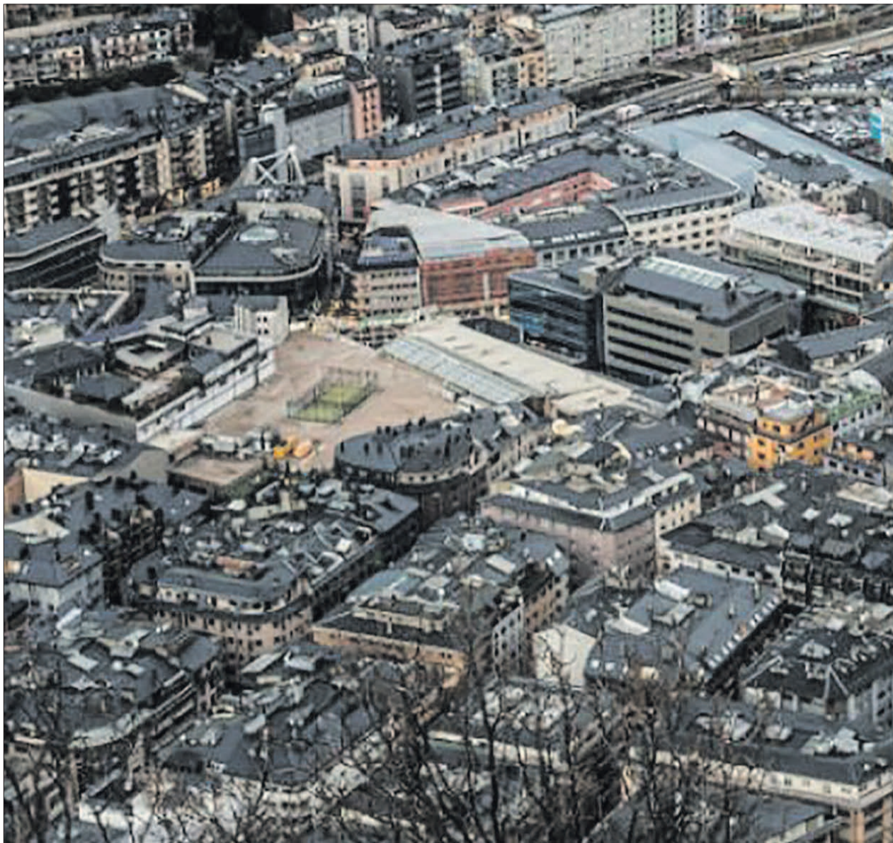
►► Aerial view of the central valley.

The lawyer handling the case of the godparents, Emili Campos, confirmed to EL PERIÒDIC that «today, the option of 1,200 euros in rent is unaffordable for Isabel», since she receives a pension of around 1,000 euros and part would include expenses such as electricity, heating, not to mention food, clothing or medicine. Nevertheless, the lawyer explained that this afternoon Isabel will go to see the flat and that from here on «it is a situation of absolute indeterminacy that will be found in front of us. Three days before an eviction, she must be very sure of what she is doing.»