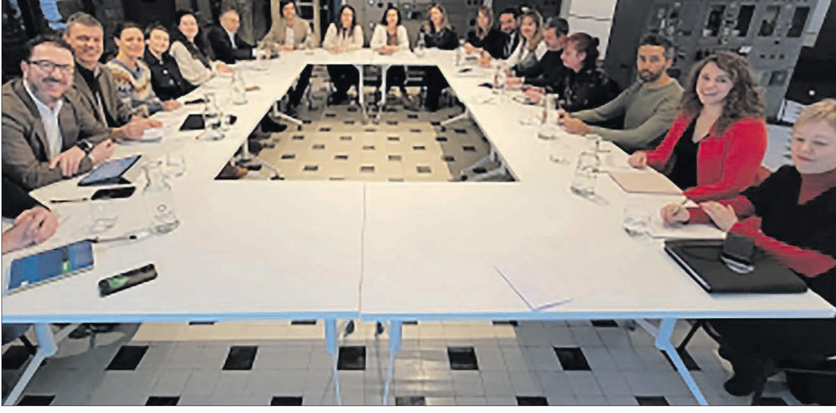
▶▶ The meeting of Infoturisme members.

Specifically, a specific module will be installed that will facilitate navigation for people with different degrees and types of disabilities. In fact, Infoturisme has been working for years to improve accessibility