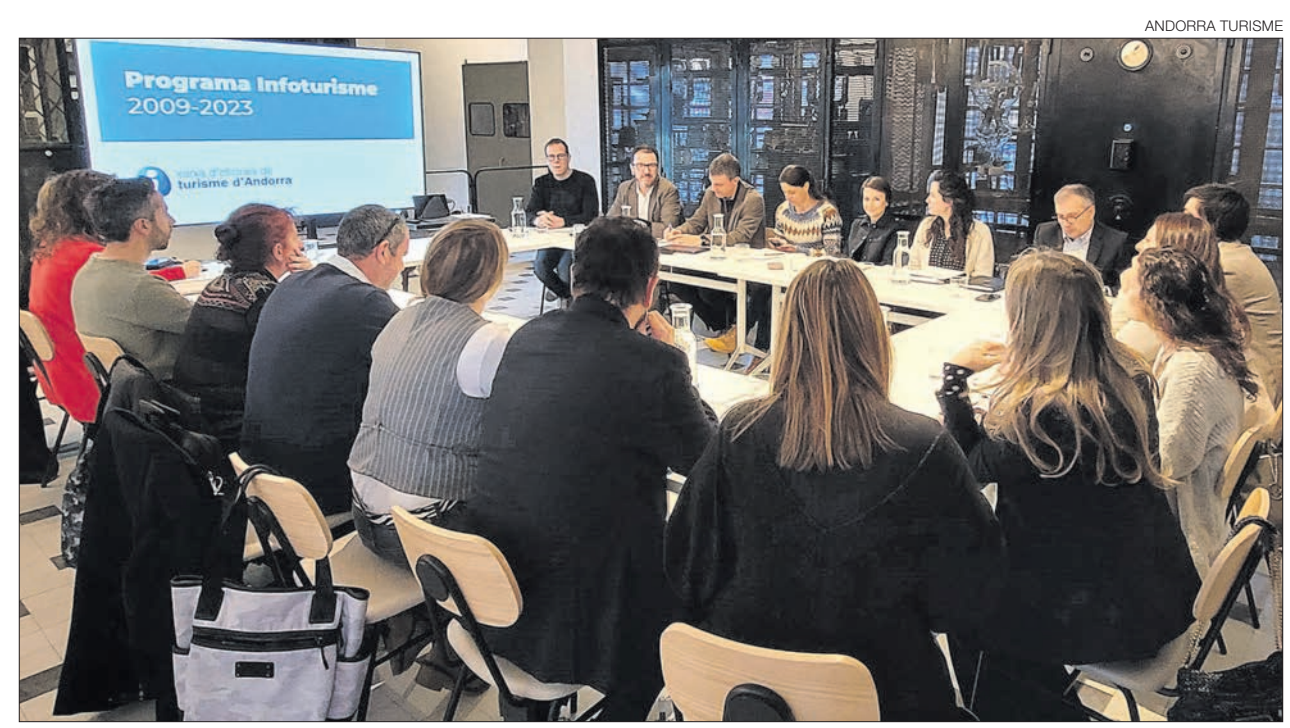
▶▶ A moment from the meeting of Infoturisme members.

INFOTURISME// Infoturisme is an initiative formed by Andorra Turisme and all the municipal Tourism departments. Since its creation, now 16 years ago, joint initiatives have been carried out such as the creation of promotional material-guides, maps, etc. - and merchandising, the development of mobile applications, the installation of signage and counters at mountain passes or the promotion of products for the family public, such as the 'Find the Tamarro' itineraries, among many ot-