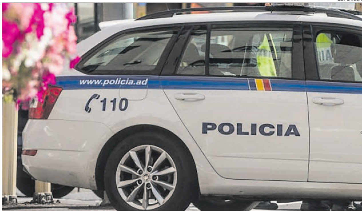
►► File image of a police car.

A 23-year-old woman was arrested on Wednesday at 4:00 p.m., on the border of the Runer River, for possession of 12 grams of «tusi» (pink cocaine). The arrested wo-