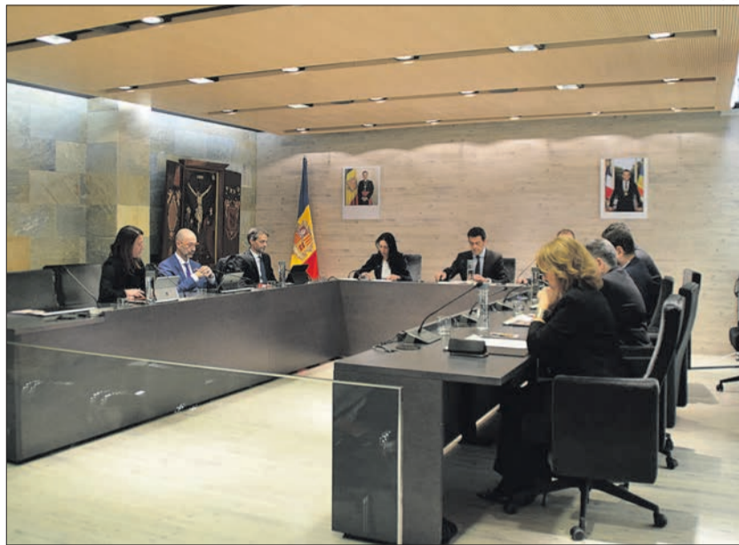
►► Session of the Municipal Council of Ordino last friday.

Likewise, the Code of Conduct was unanimously approved by all the councilors and without making any kind of verbal contribu-