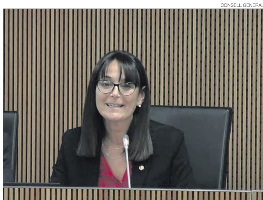
►► The Minister of Culture, Youth and Sports, Monica Bonell.

The resolution has funded two project proposals and one position has been left vacant