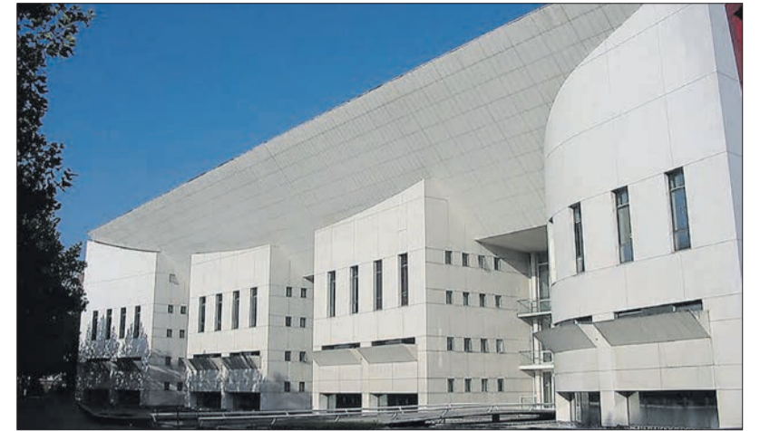
►► The National Conservatory of Paris, where one of the prize winners will study.