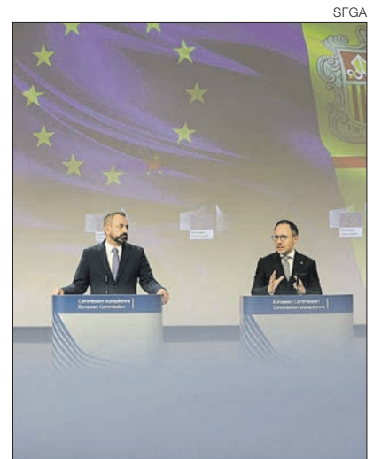
►► Luca Beccari and Xavier Espot

More demand for citizen participation/ The report has also given space to citizens' interest in participating in decision-making on the country's main issues. So, 60.8% believe that public opinion is very important, while 13.9% say the opposite. Along the same lines, 69.3% do believe that there is an interest on the part of the people in participating in decisions, although 58.3% mention that the opinions are not taken into account by the administrations. In addition, 47.6% affirm that they do not have sufficient mechanisms to make their voice heard and to deliver the proposals in question.