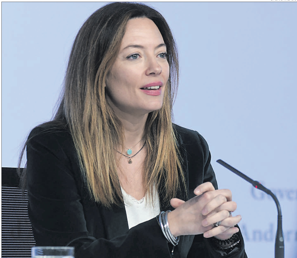
► The Minister of Health, Helena Mas, during the presentation of the National Pact roadmap.

To follow this line, the Ministry has put on the table a series of surveys, assessment processes on the state of health in the country and the dissemination of healthy lifestyle habits, but not only physically, but also mental and addictions,