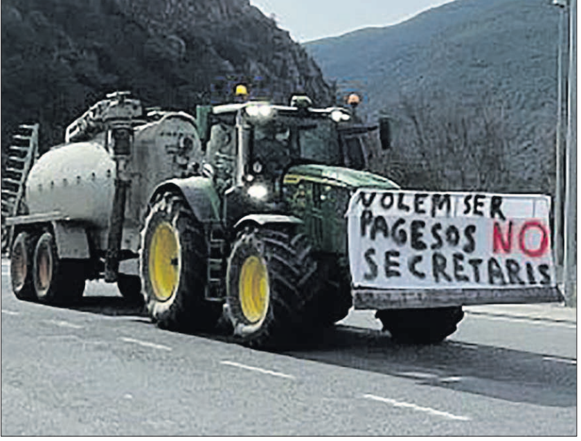
►► Farmers' mobilizations in Andorra.