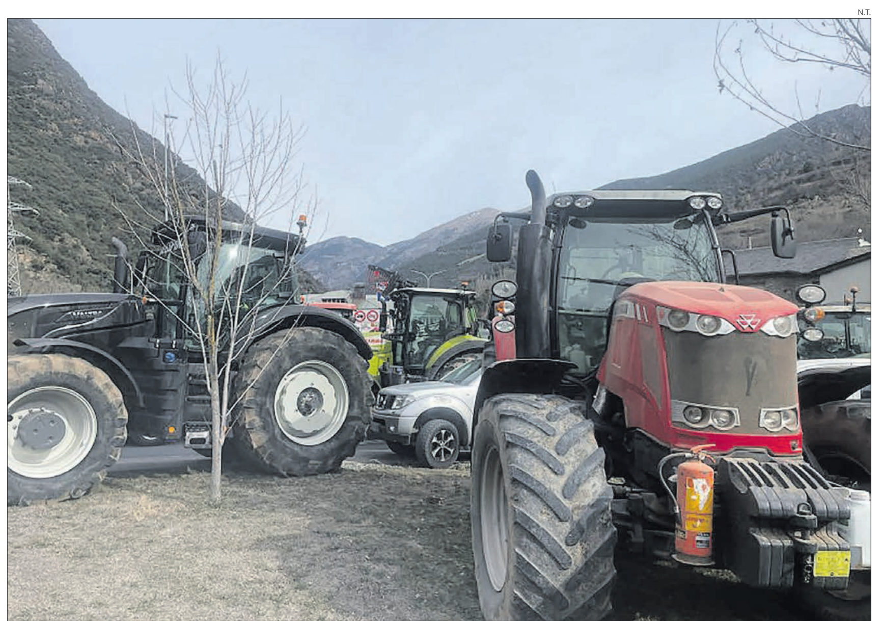
▶▶ Tractors during the cut on the Andorran border.

The mobilizations will be concentrated in the Cerdanya area, mainly between Jonquera and Viella