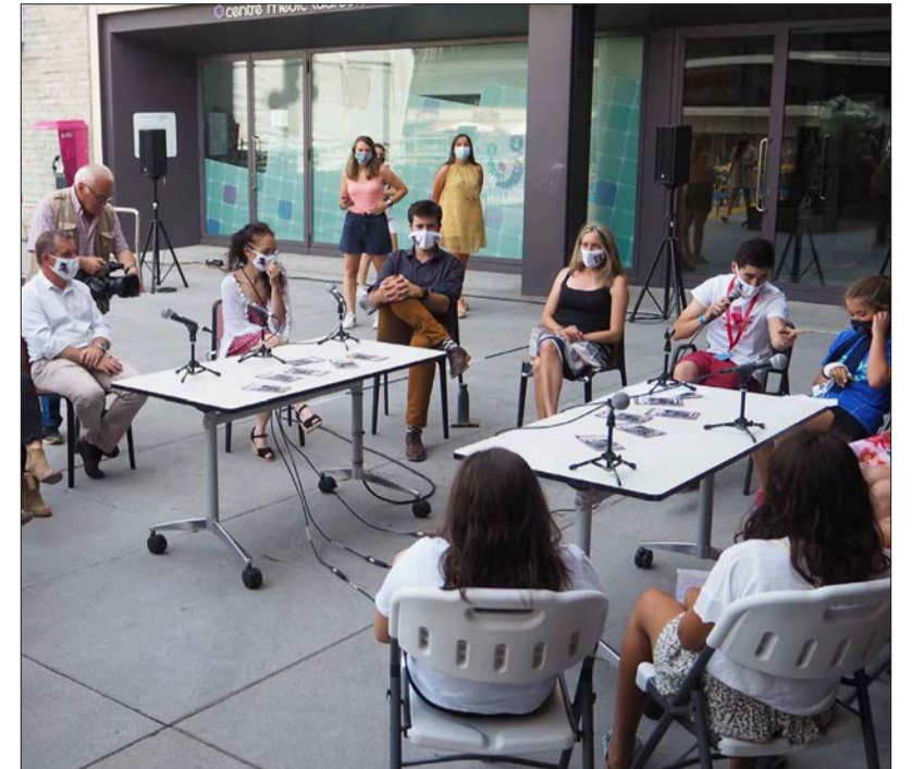
►► The festivities radio, in the 2021 edition.