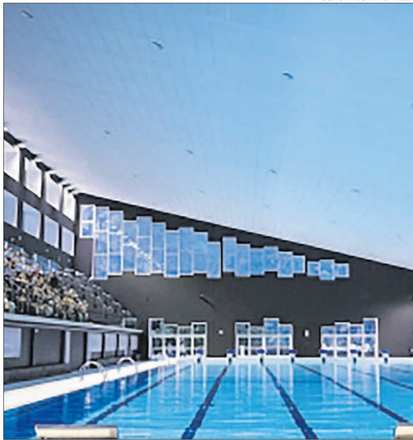
►► The indoor pool of the Serradells Sports Centre, in Andorra la Vella.

The indoor swimming pool of the Serradells Sports Center will have a technical stop during the month of August. Specifically, it will be closed from Monday, July 31, until Sunday, August 20. The aim is to be able to carry out various maintenance tasks on the beaches and bleachers taking advantage of the summer season, where demand is lower than the rest of the year. Throughout the year, this facility is used not only by private users, but also by professional sports groups and teams who train in the pool. During the month of August, however, athletes take vacations and a large number of users take advantage of the opening of the outdoor pool. For this reason, it has been decided to carry out the tasks during the weeks of less activity and thus have less impact. The work that will be carried out during these days will focus on the beaches and the bleachers, without affecting the swimming pool area. This year, the water in the pool will not be emptied, as was done previously. Despite the fact that it was opened last year after the fire of 2018, actions are taken every season to guarantee the good conditions of the equipment. As an alternative, users can go to any communal swimming pool that is