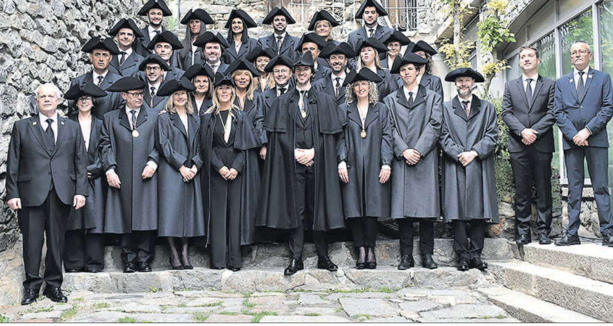
▶▶ The new general councilors in the traditional photograph on the steps of Casa de la Vall.

Enseñat's first words / «We must bet that the Parliament is an essential pillar of today's Andorra», said Enseñat in his first words in his new position, in addition to advocating for this Council to have a paper «transparent, open to citizens and that shortens the distance between the institution and the sovereign people. In short, a Council