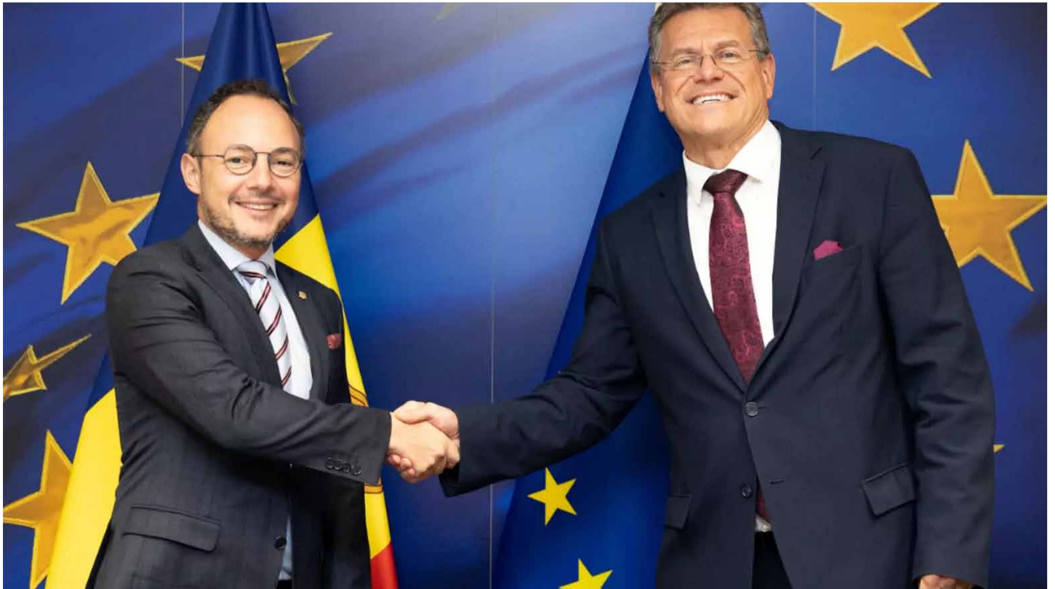
The head of government, Xavier Espot, and the executive vice-president of the European Commission, Maroš Šefcovic.