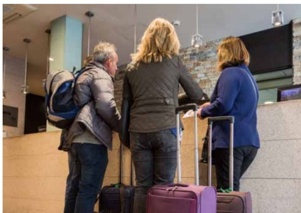
The employment figure in August last year was 80.70%.

In addition, the Hotel Union underlines the delay in the arri-