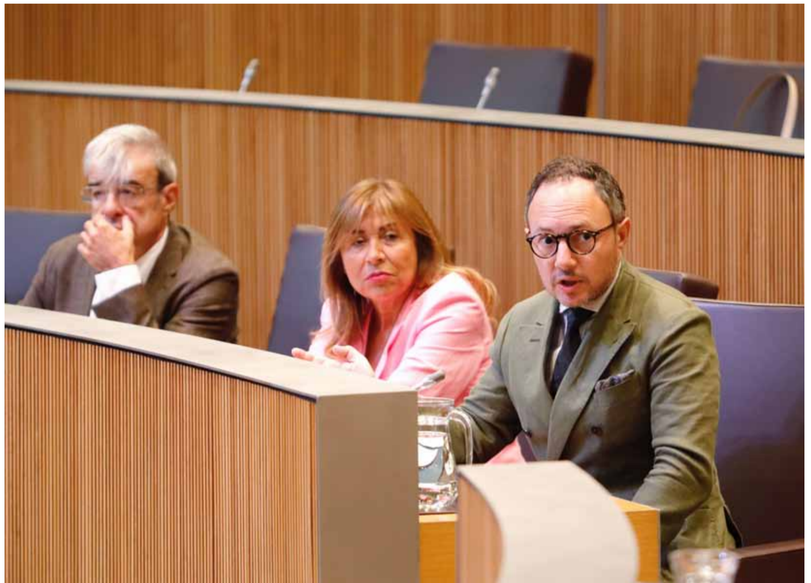
The head of government, Xavier Esport, during the session of the General Council held.

In response, Esport assured that «we do not intend to provisionally apply the Agreement without consulting the public». Apart from this, he defended that the Agreement with the EU is beneficial for the country, emphasizing