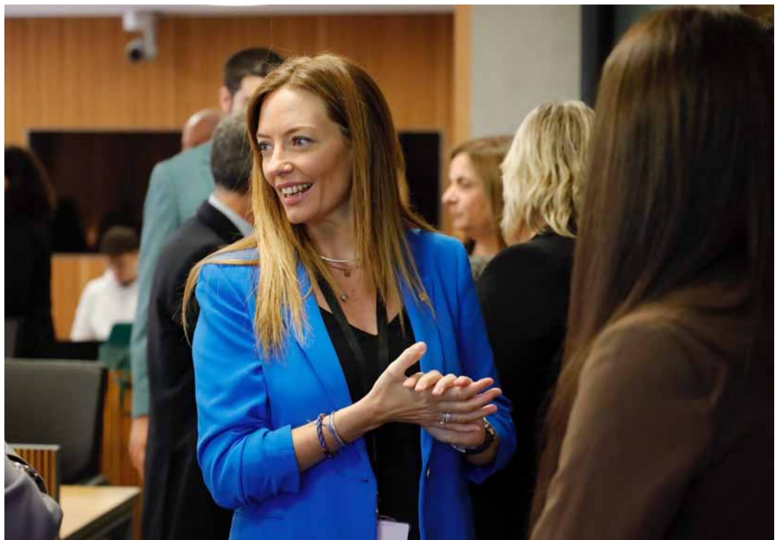
The Minister of Health, Helena Mas, before the appearance before the legislative commissions for Social Affairs and Equality and Health.

Therefore, the minister explained that the main concern of the residents derives from a lack of communication in the initial phases of the project. The complaints center on the installation of mental health services in a building that also has a shared entrance with other residents. Mas reaffirmed that these facilities are for external consultation, intended for profiles that do not require a high level of assistance, and that the Ministry of Health is working to improve communication with the resident's association. As an example, Mas talked about people with eating disorders or some degree of de-